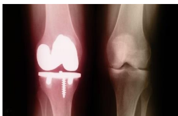
Forged and swaged gum-metal alloy