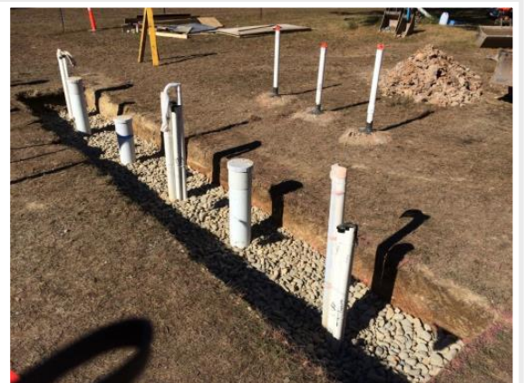
Field-scale replication of legacy waste trenches at Little Forest Site, Sydney Australia. Photo shows one of four trenches excavated to replicate hydraulic and biogeochemical processes, and also to test remediation technologies (e.g. in-situ grouting using colloidal silica).

Shotgun metagenomics coupled with multiple field- and laboratory techniques allowed the reconstruction of major biogeochemical pathways at the Little Forest Legacy Radioactive site, Australia. This is essential for understanding contaminant migration pathways